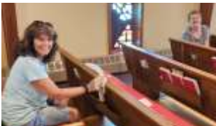
Cleaning Day June 4