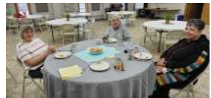
Volunteer Brunch June 13